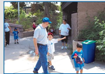
Zoo Field Trip